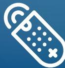
REMOTE CONTROLS, PHONES, COMPUTER EQUIPMENT, POS TERMINALS