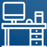
TABLES, CHAIRS, OFFICE EQUIPMENT AND KEYBOARDS