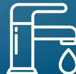
DOORS, TAPS AND DISPENSERS