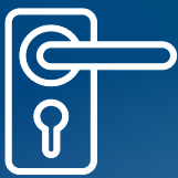
HANDLES AND FURNITURE