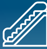
HANDRAILS, RAILINGS, SUPPORT POINTS